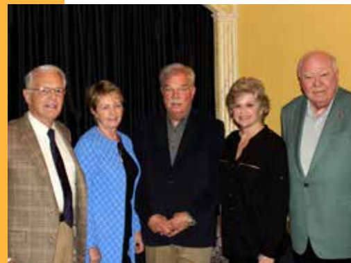
*Charter members of the Tocqueville Society founded in 1995 that continue today.